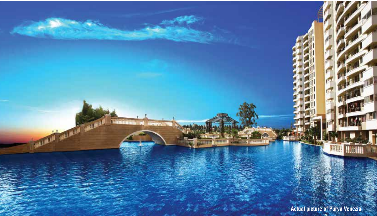
Actual picture of Purva Venezia

If you've always believed in high quality living, it's time to put your beliefs into action. With a view of 1600 acres of greenery belonging to the University of Agricultural Sciences and an ideal location, Purva Venezia offers you a lifestyle that is too good to resist.