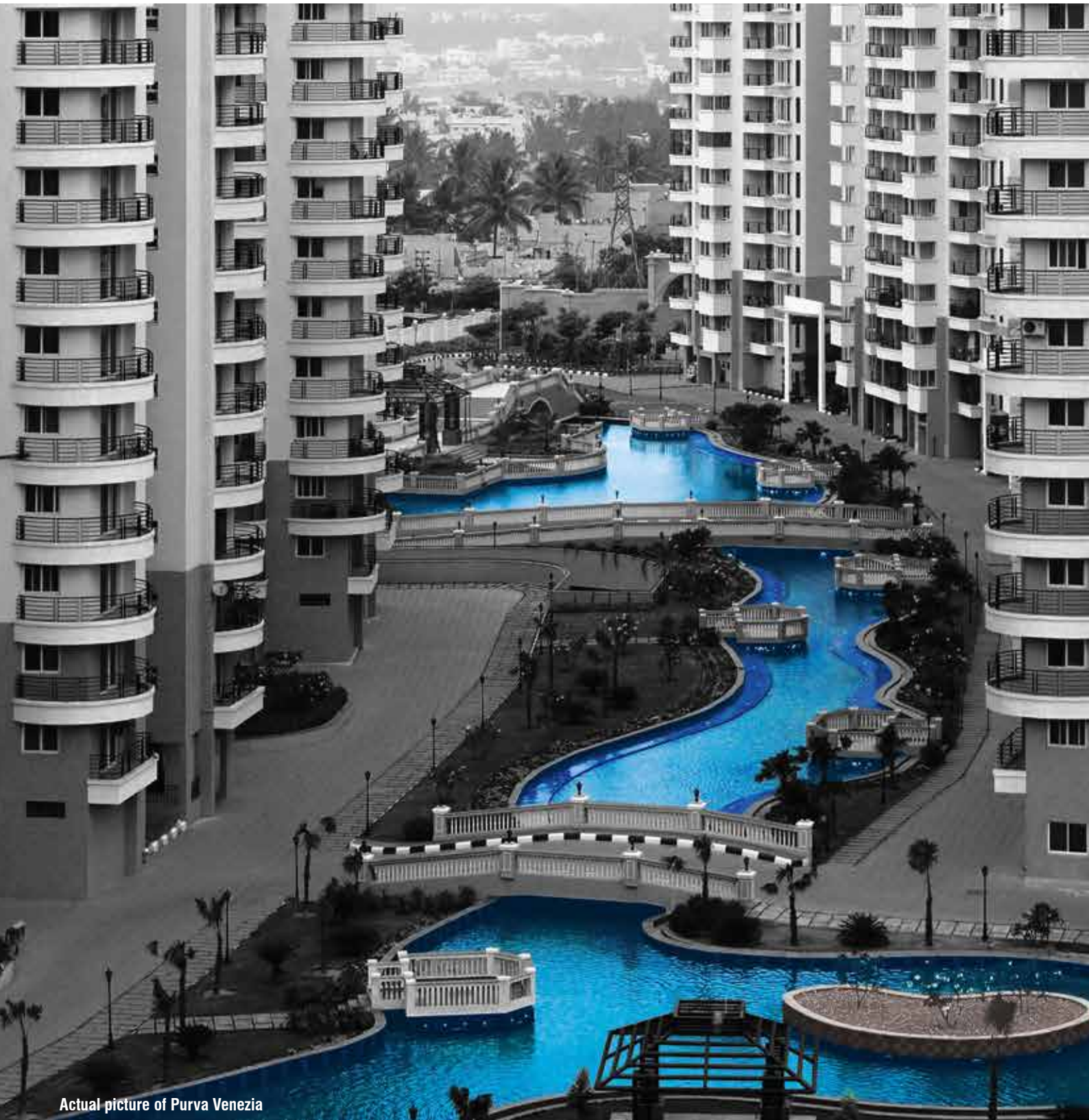
Actual picture of Purva Venezia

PURVA VENEZIA Luxury apartments, Yelahanka The spirit of Venice in Bengaluru