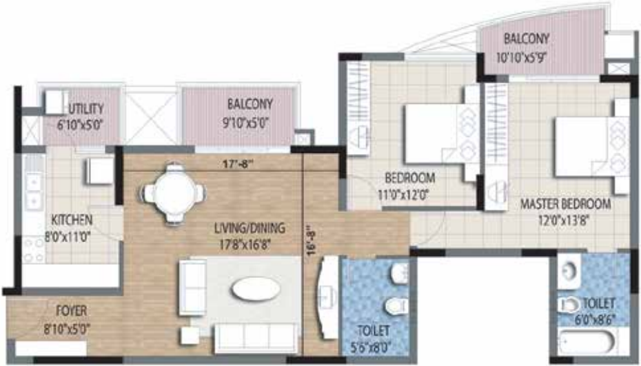
2 BHK Type A – 1322 sq. ft.