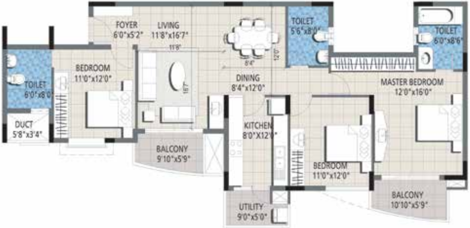
3 BHK Type C – 1610 sq. ft.